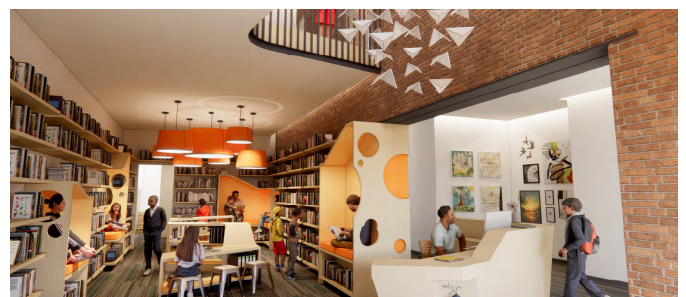
Tree House Books now owns their property in North Philadelphia and has renovation plans as depicted in this artist's rendering.